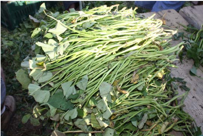
Sweet Potato slips

1.) A farmer beds 18 sweet potatoes. The farmer waters them daily and monitors growth. After a few weeks the farmer will start to see stems emerge from the soil. The farmer cuts about 144 slips from the bedded sweet potatoes. On average, how many slips did each bedded sweet potato produce?