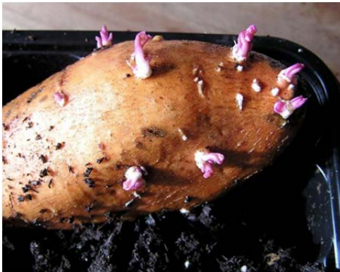
Picture of sweetpotato nodes